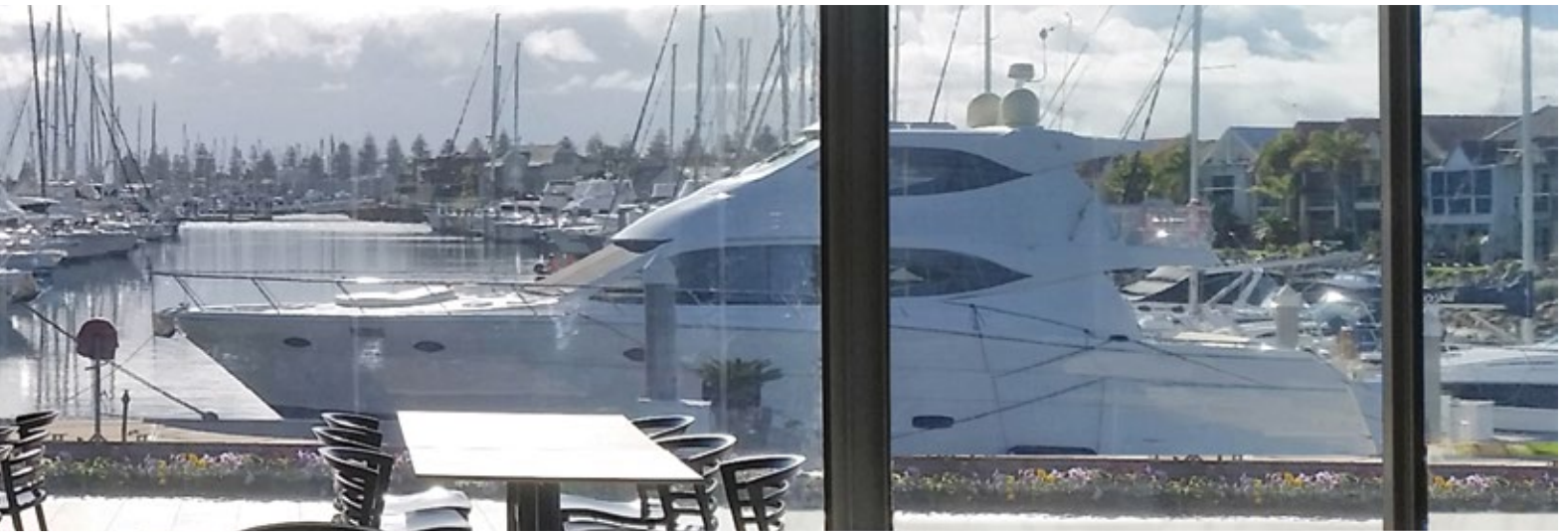
1.00mm DS Smoke