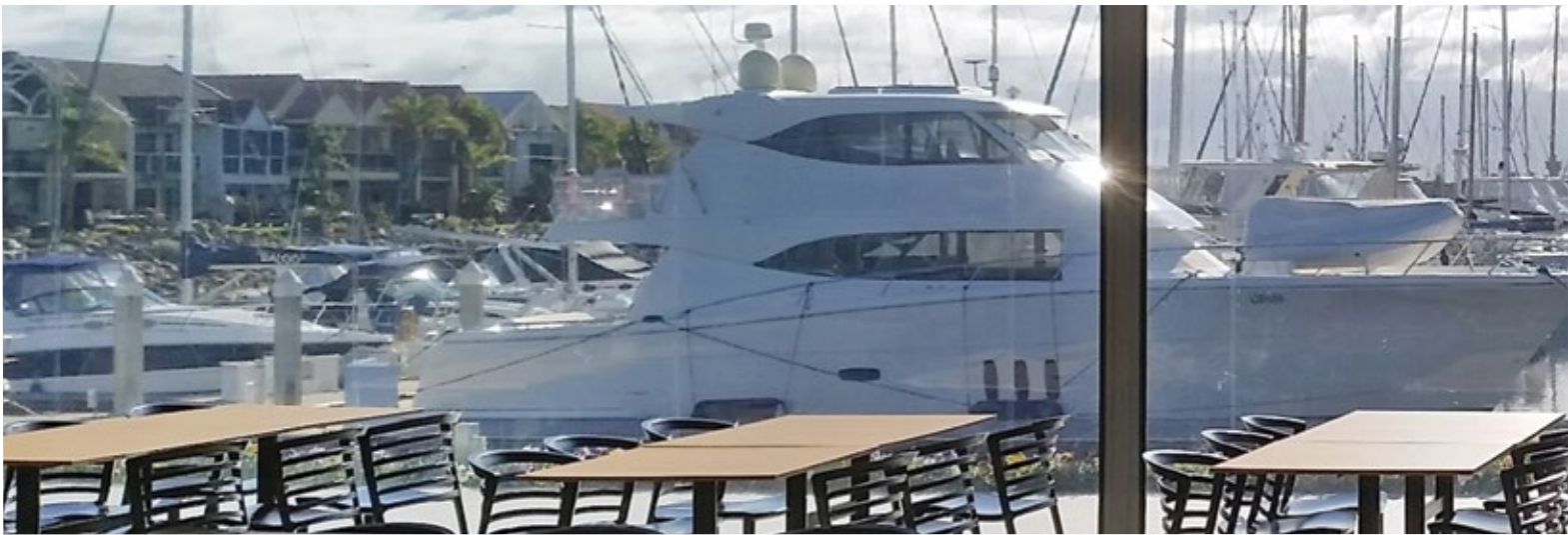
0.75mm DS Clear