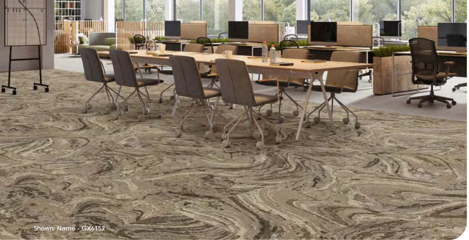
Shown: Name - GX6152