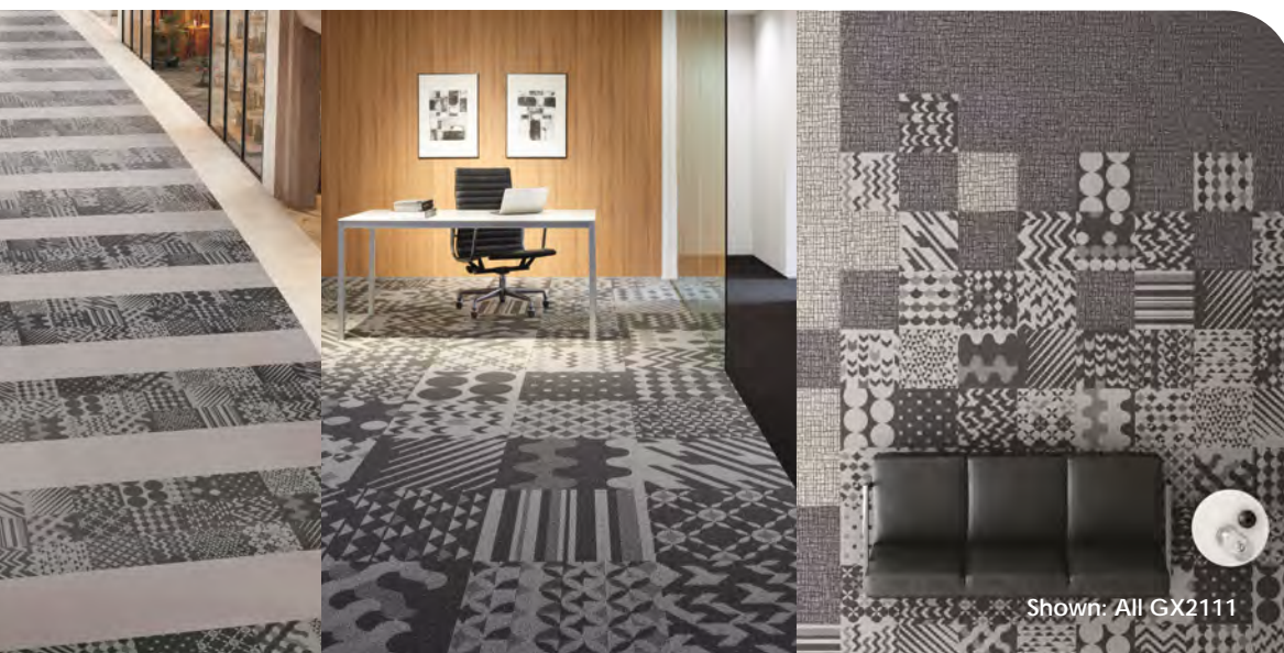
Shown: All GX2111