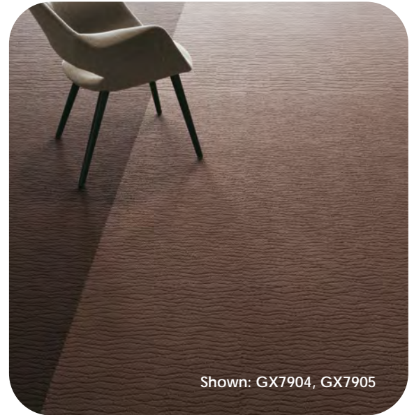
Shown: GX7904, GX7905