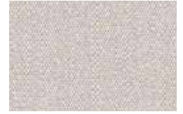
Pierre (Stone) 6196