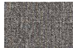
Flanelle Chiné U104