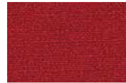
Rouge (Paris Red) 3914