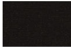
Noir (Black) 6028