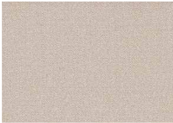
Grège (Raw) 6020