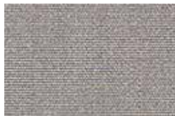
Gris (Grey) 6088