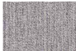
Souris Chiné (Lead Chiné) 8396