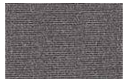
Ardoise (Slate) 8203