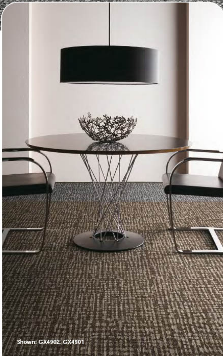
Shown: GX4902, GX4901