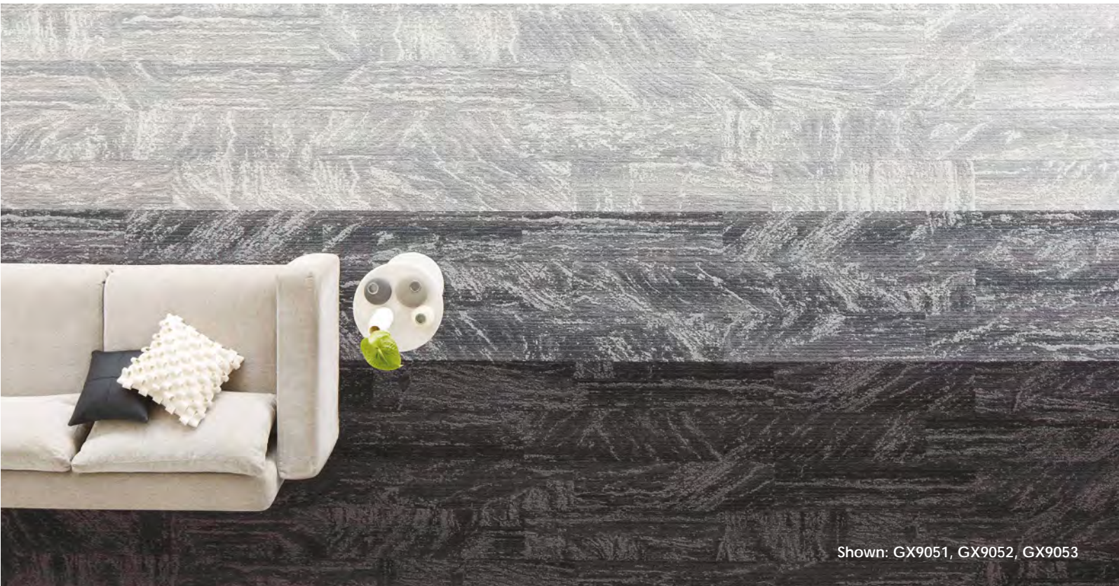
Shown: GX9051, GX9052, GX9053

Over many centuries, the use of stone and its unique random pattern has played a prominent part in construction, however despite its history, it is still considered a modern finish. Whilst hard polished surfaces are stylish, they are not practical in terms of acoustics and general comfort. The Srone carpet tile range provides a solution without compromise. Soft and functional flooring in a dynamic, stone-like pattern.