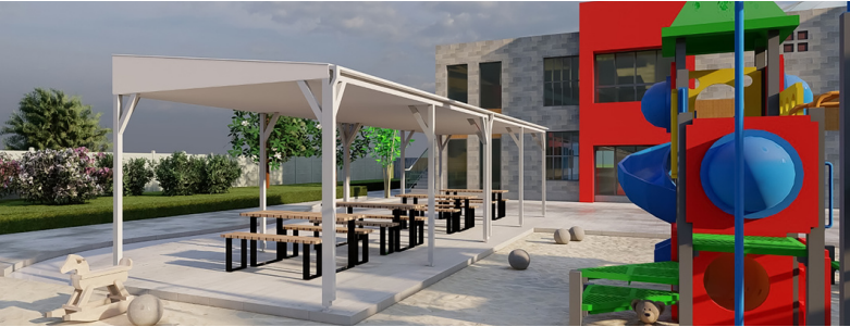
COLA, COVERED WALKWAYS & MARQUEES