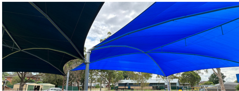
SHADE SAILS & STRUCTURES

Nolan Carpets is a division of the Nolan Group. With over 100 years experience, we've become the 'house of brands' in the Australian commercial and education textiles industry.