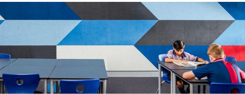
ACOUSTICS & UPHOLSTERY