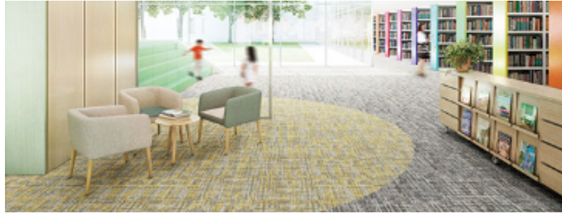
CARPET & CARPET TILES