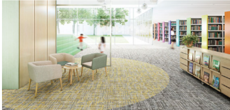
CARPET & CARPET TILES