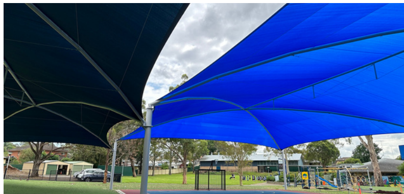
SHADE SAILS & STRUCTURES

With over 100 years experience, we've become the 'house of brands' in the Australian commercial and education textiles industry.