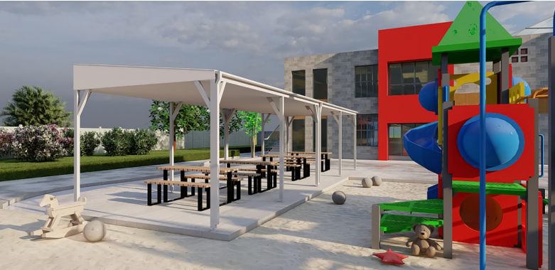
COLA, COVERED WALKWAYS & MARQUEES