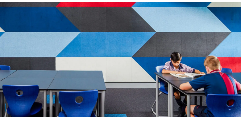
ACOUSTICS & UPHOLSTERY