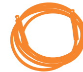
Black Rubber Hose