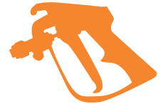
Professional Spray Gun with 11002 Tip