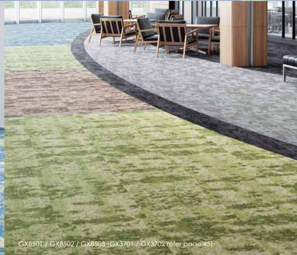
GX8501 / GX8502 / GX8503 (GX3701 / GX3702 refer page 45)