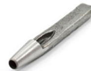
Hand Side Cutter #0 1/4" or #2 3/8"