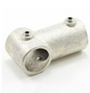
Slip Fit Tee with Screws