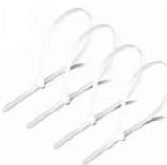
Nylon Cable Ties