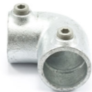
Slip Fit Elbow